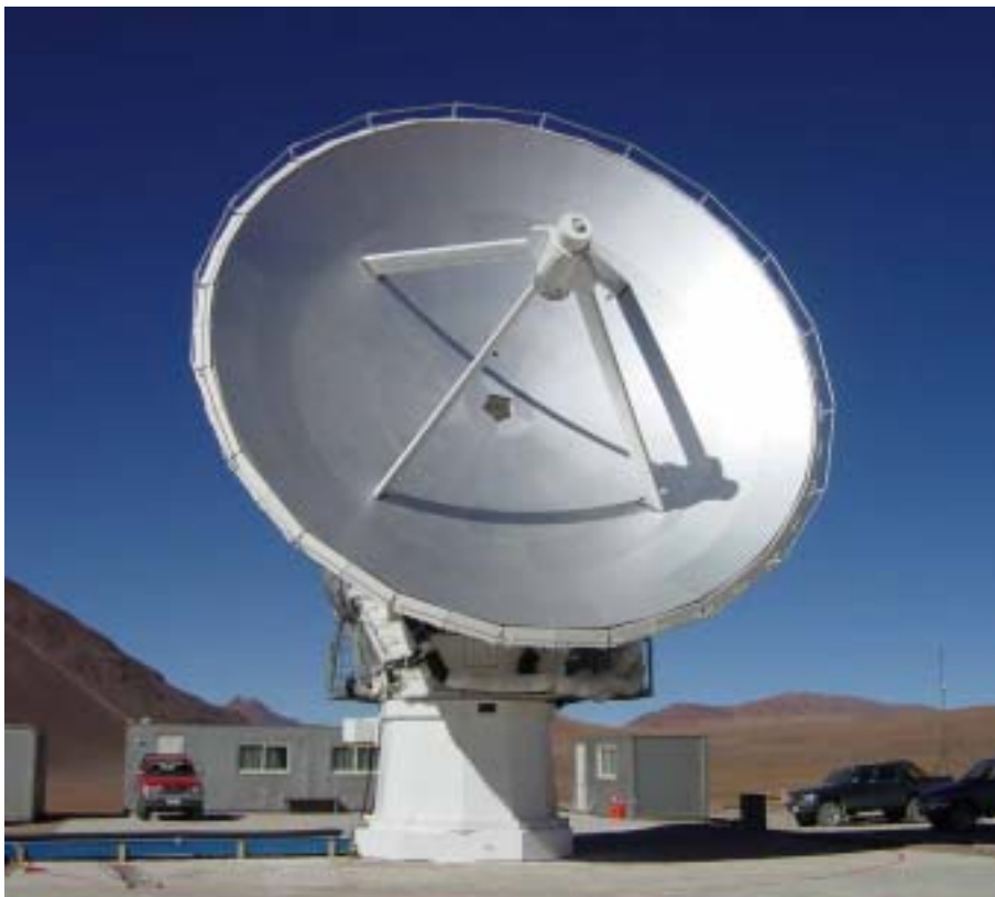
Figure 2. ASTE 10 m antenna installed at Pampa la Bola