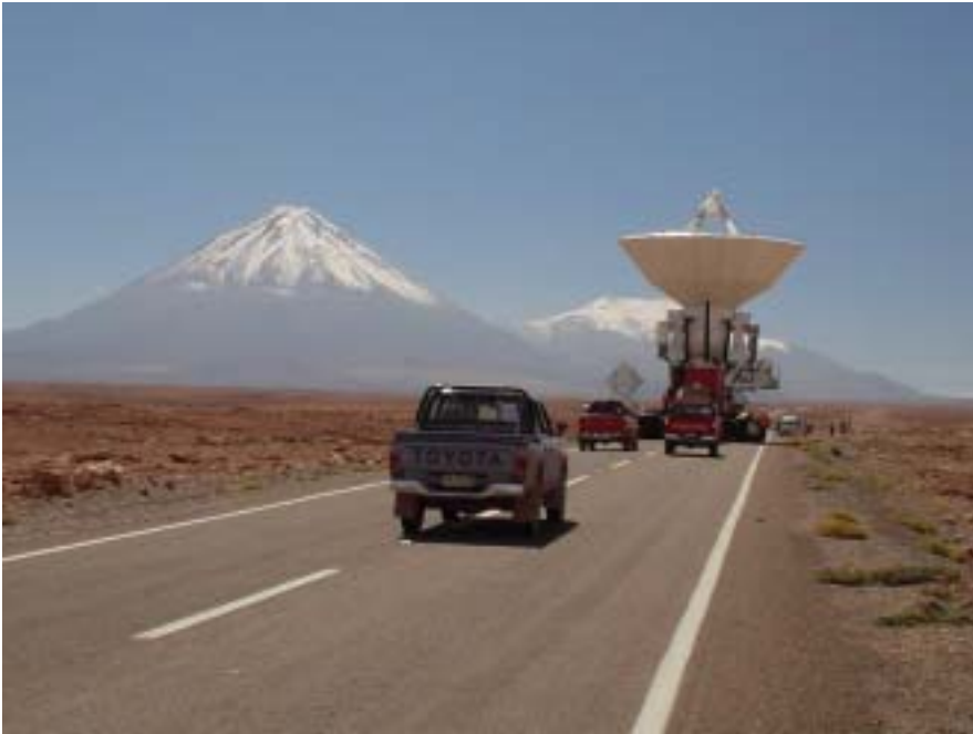
Figure 1. Transport of the ASTE 10 m antenna to Pampa la Bola